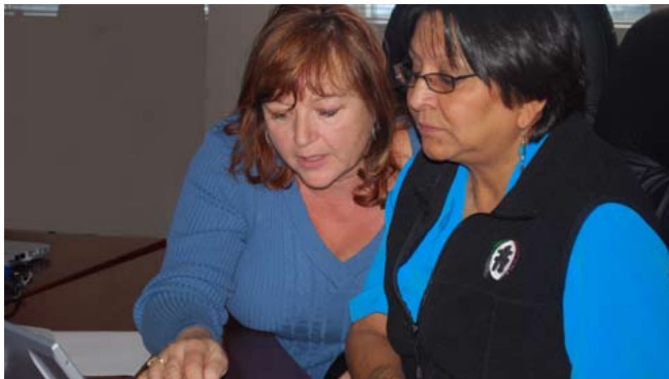
More than 200 First Nations communities and organizations are using the @YourSide Colleague cancer course

More than 200 First Nations communities and organizations in Manitoba, Saskatchewan and British Columbia are using the cancer control course. Delivered virtually, it supports communities facing barriers to training such as distance, severe weather and staff shortages.